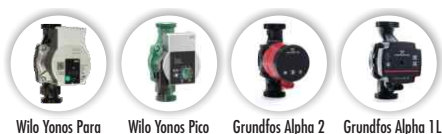
Wilo Yonos Para